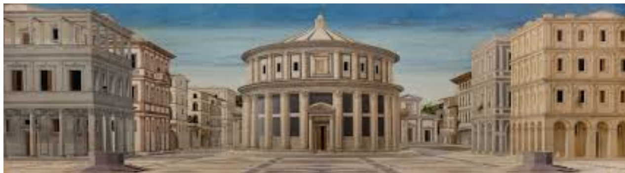
The Ideal City, unknown artist, c. 1480