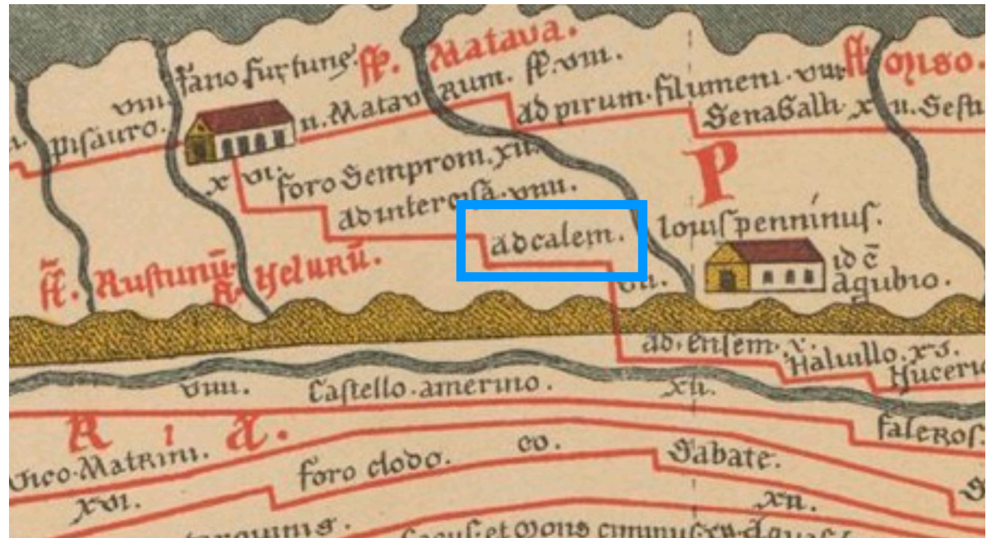
Tabula Peutingeriana (medieval copy of an ancient map from the Roman Empire times)