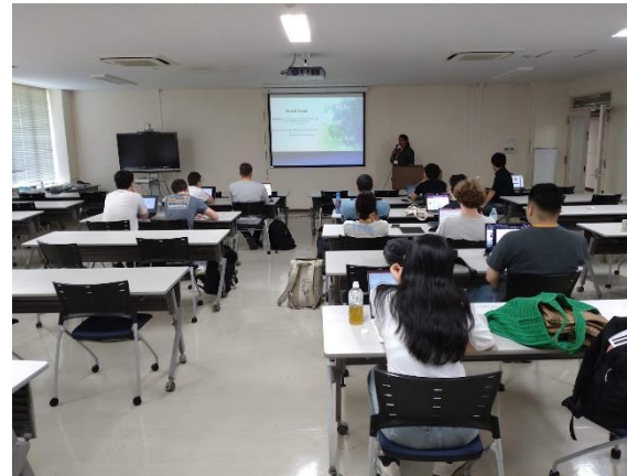
Presentation, lecture, tour at J-PARC (2023)