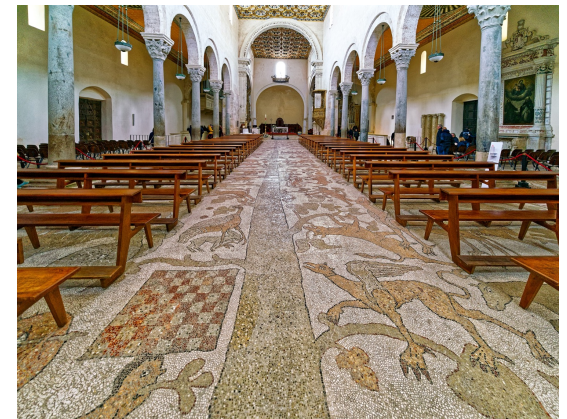
Tree of Life mosaic floor