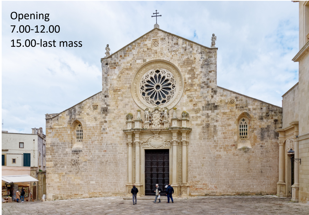
Otranto Cathedral (1068)