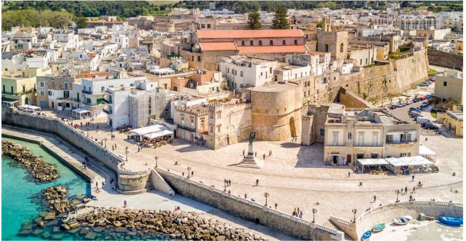
August 1480: Ottoman siege of Otranto