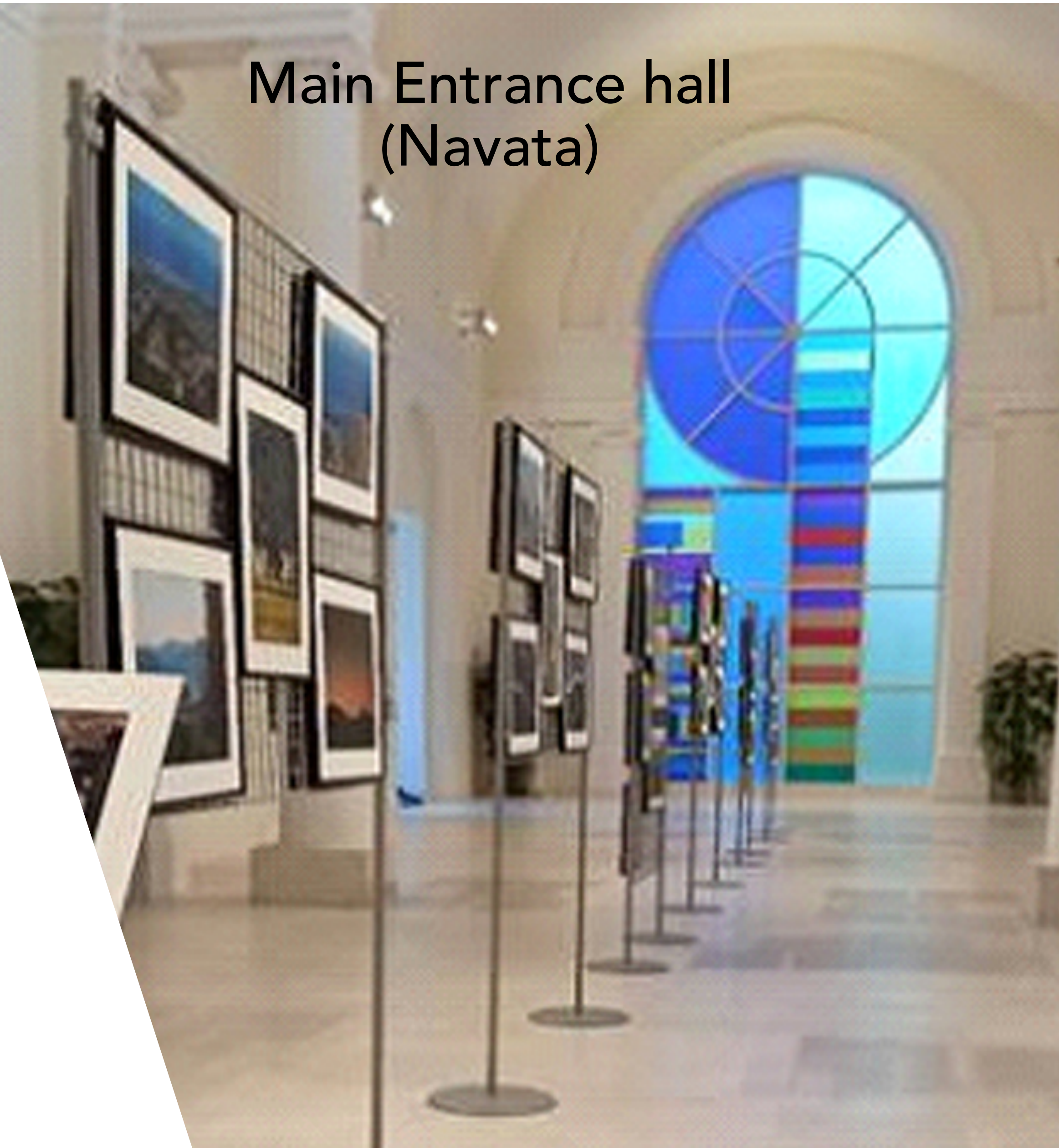
Main Entrance hall (Navata)

The poster session will take place on Wednesday afternoon in the Navata (Main Entrance Hall). Posters can be installed from Tuesday morning.