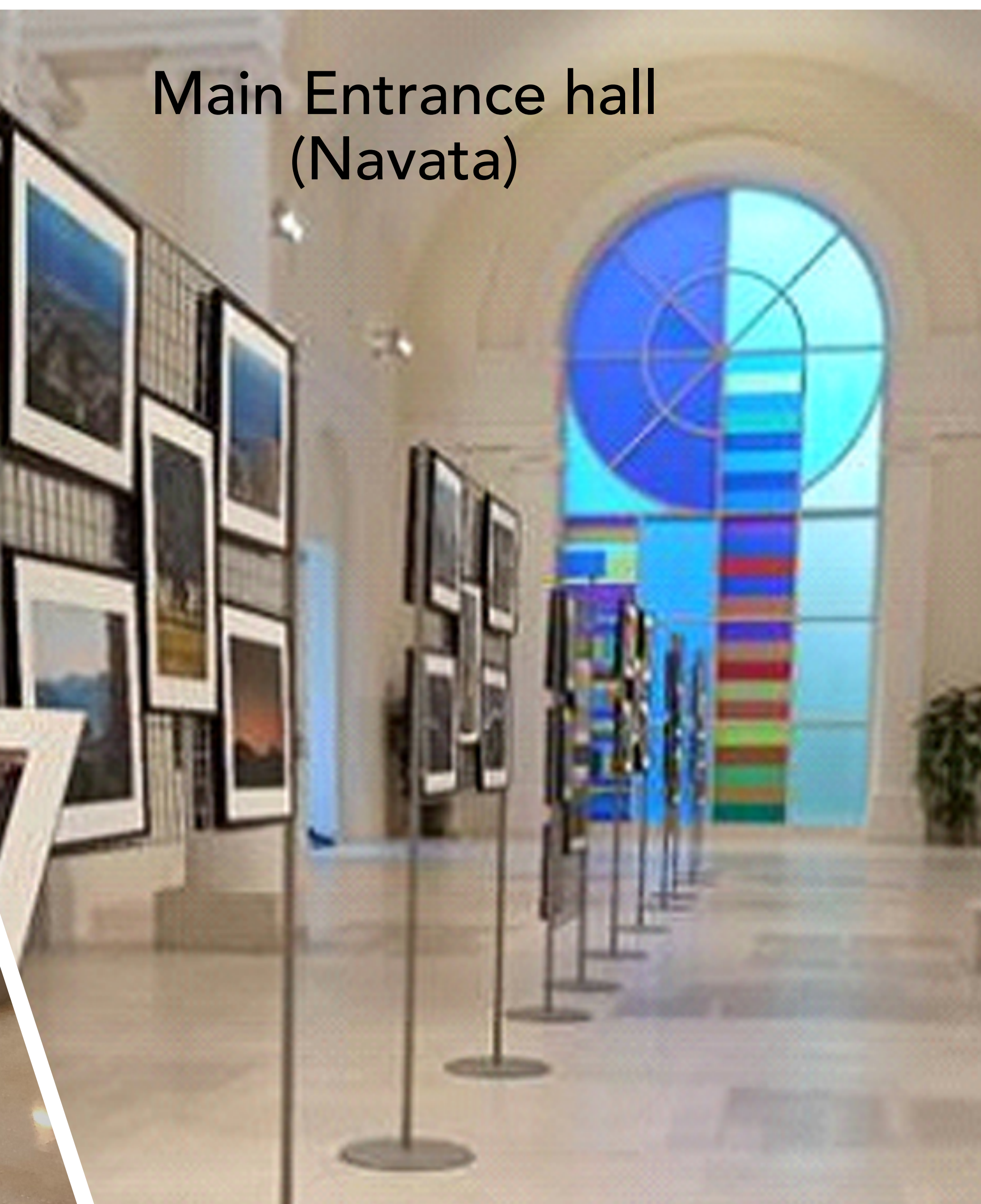
Main Entrance hall (Navata)