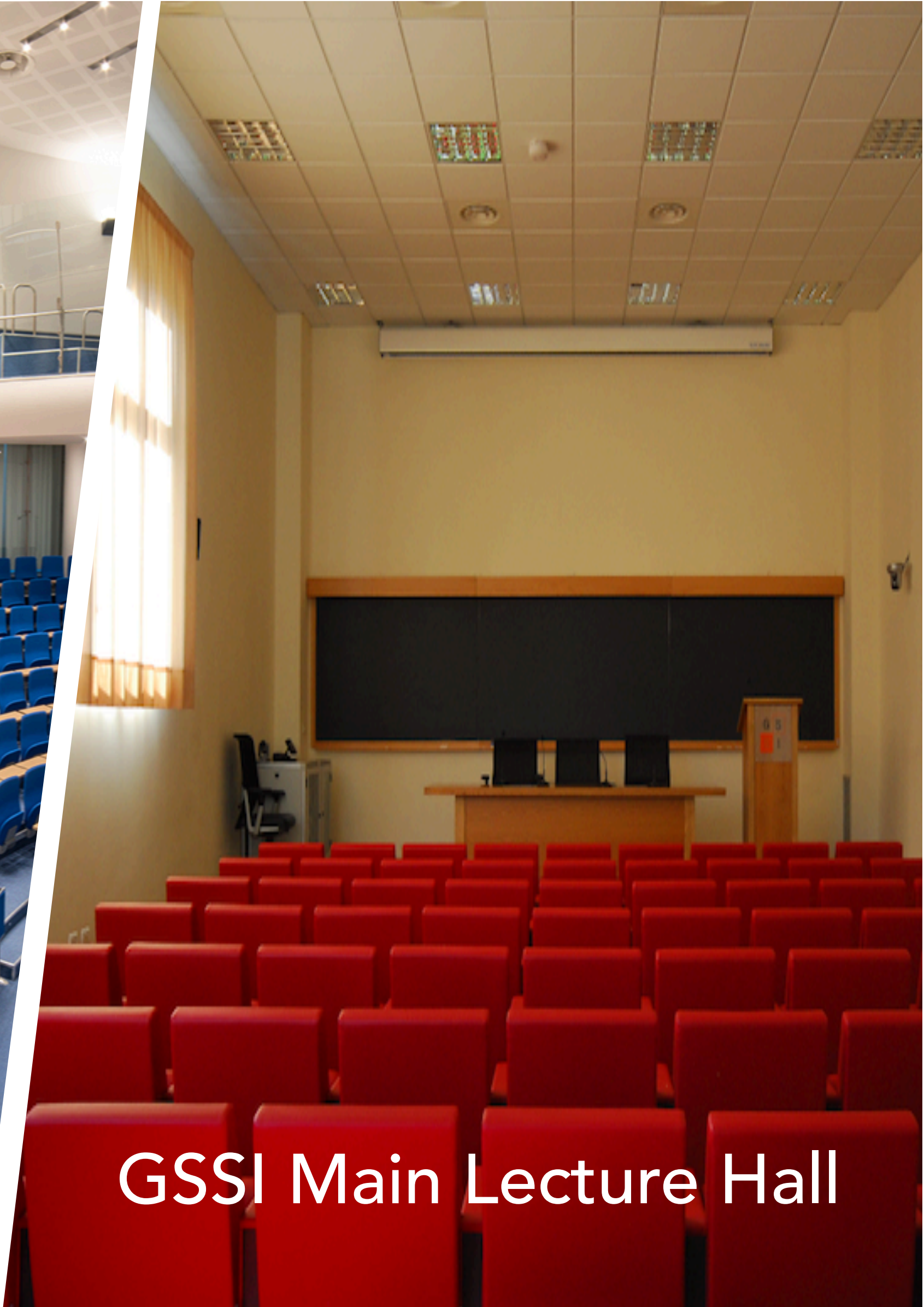
GSSI Main Lecture Hall