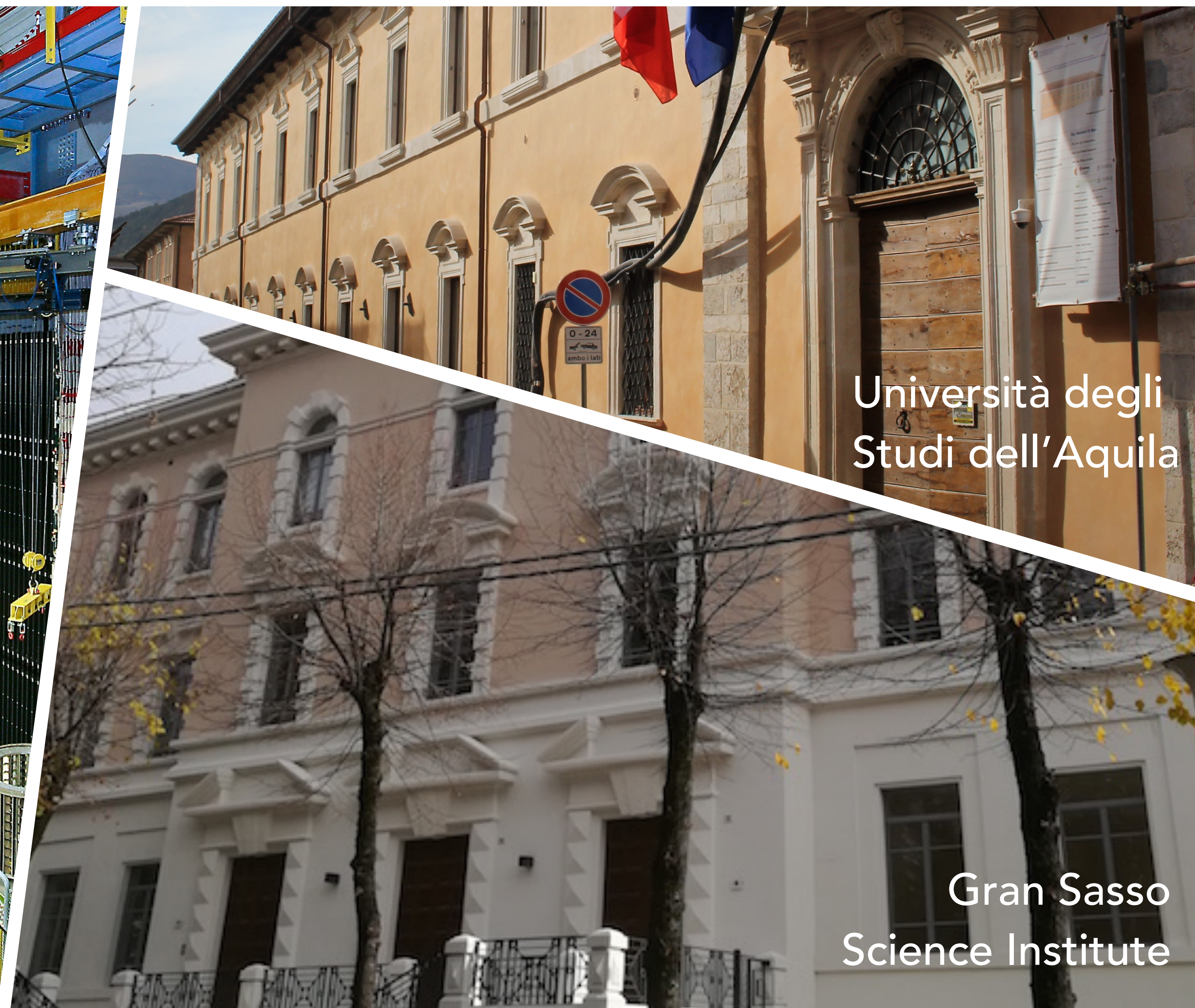
Università degli Studi dell'Aquila