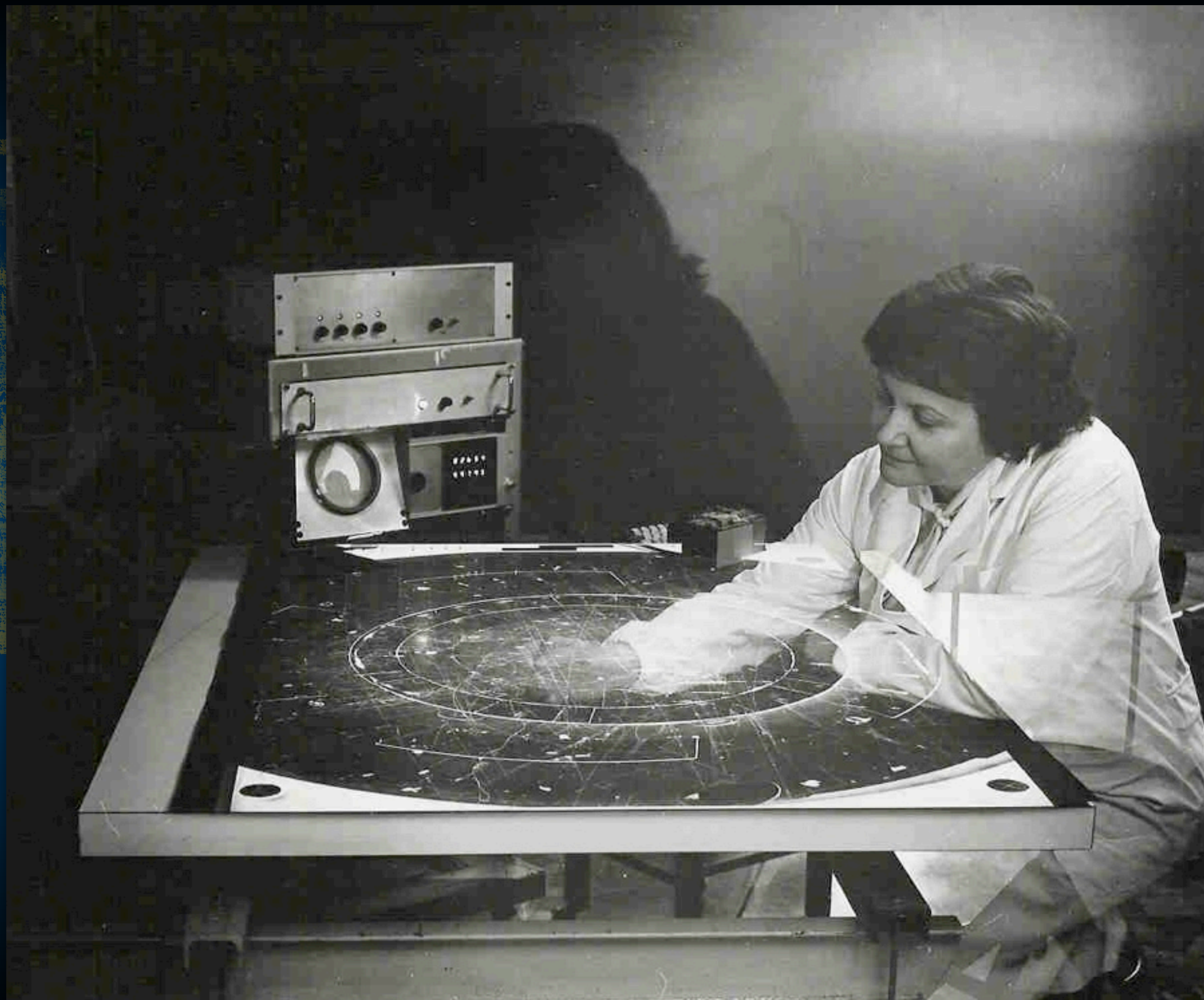
INFN Bologna Fine anni '70