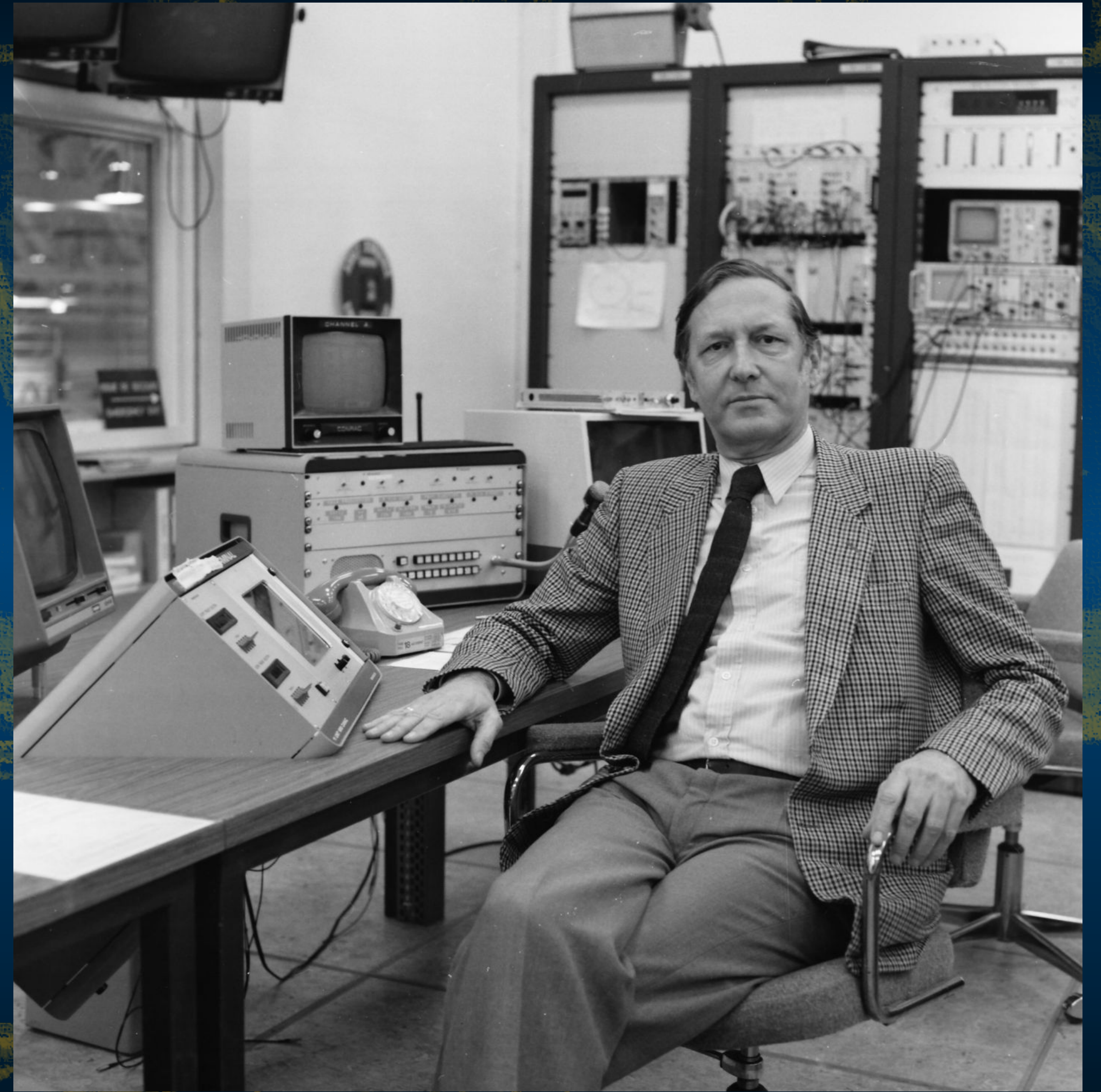
Simon Van Der Meer