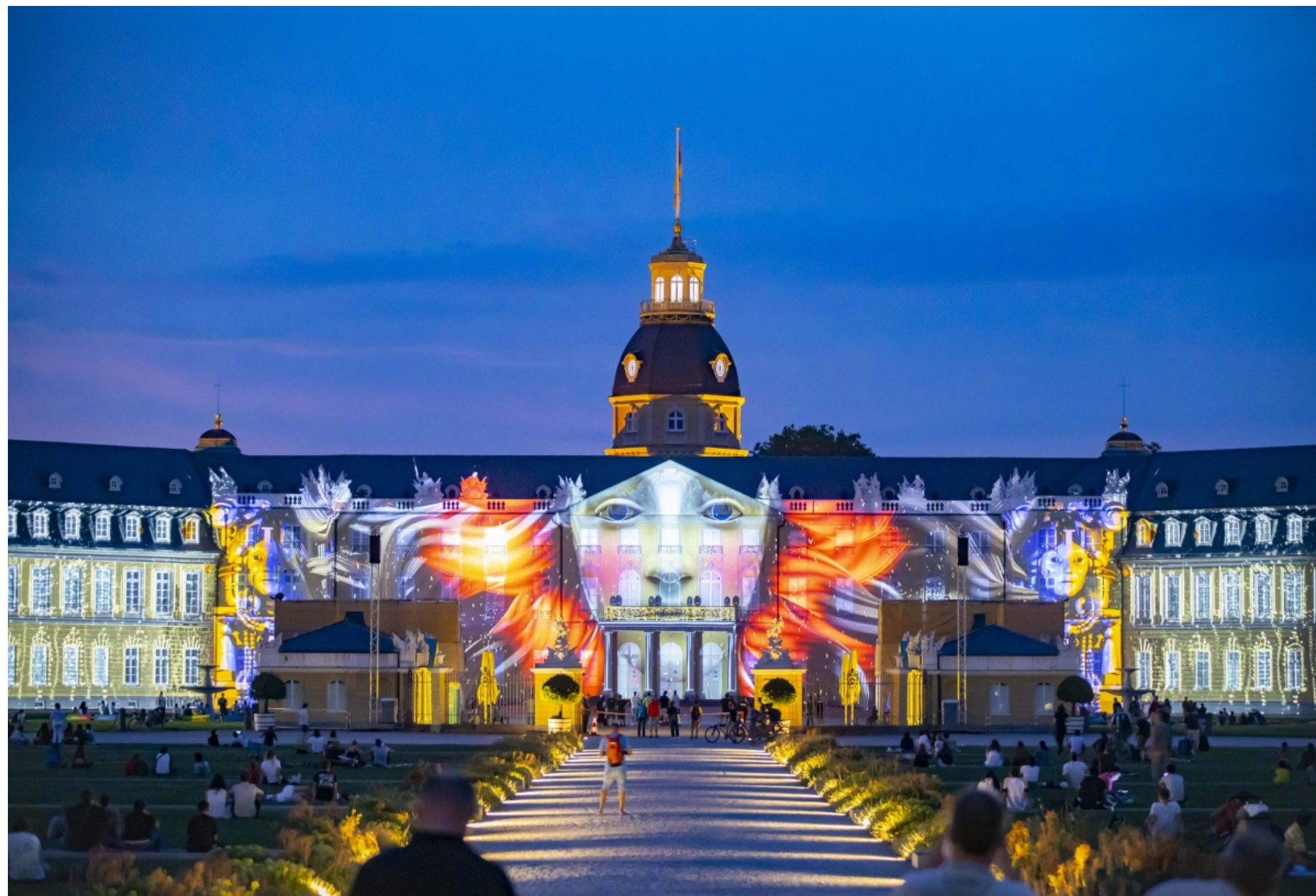
Karlsruhe Festival of lights