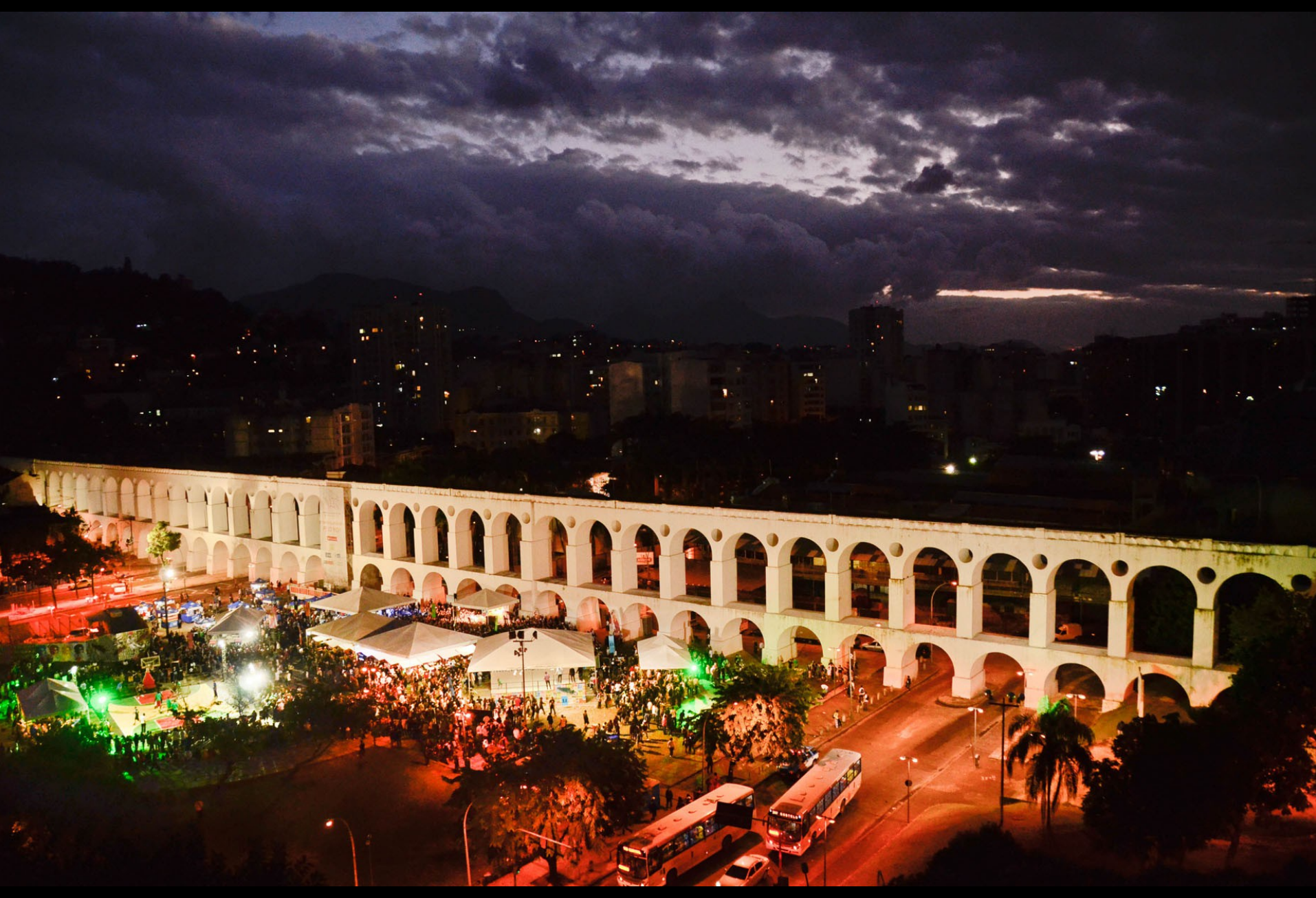
1750 aqueduct downtown Rio Now it is a tramway connecting downtown to Santa Tereza