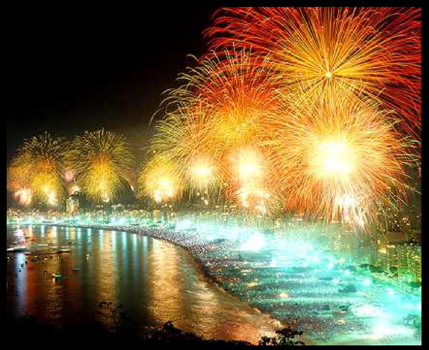
New year celebration Copacabana beach