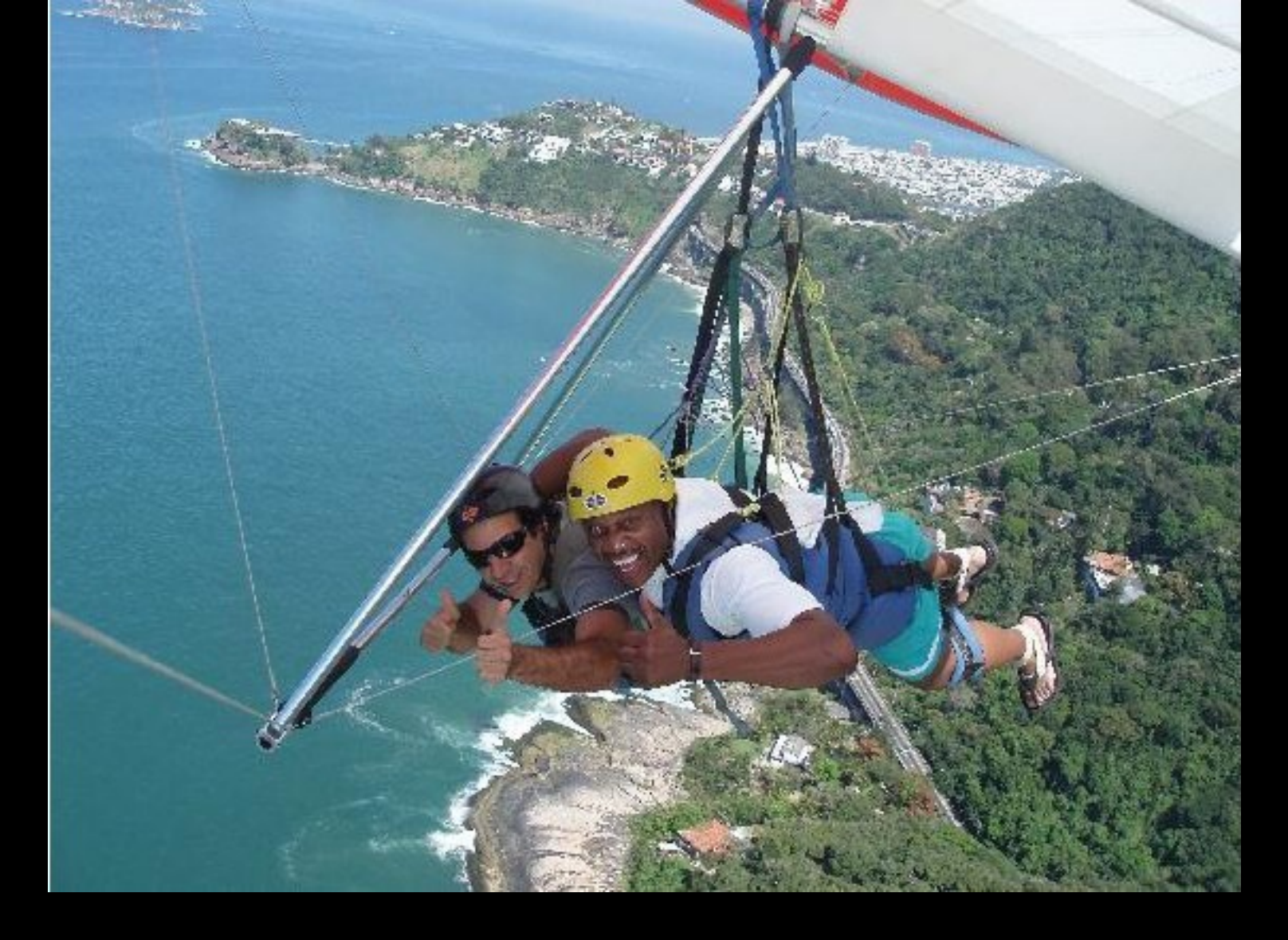
Planned social activity for NNN 24 participants