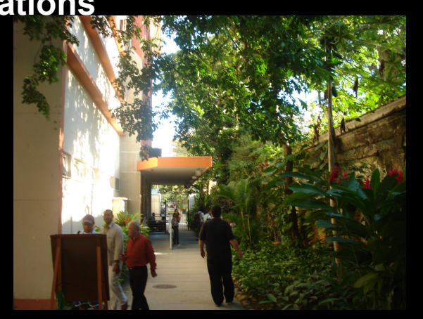
NNN dates: October/November 2024 Exact dates soon to be decided

Many hotels in the US$ 60 to US$ 100 range (breakfast included).