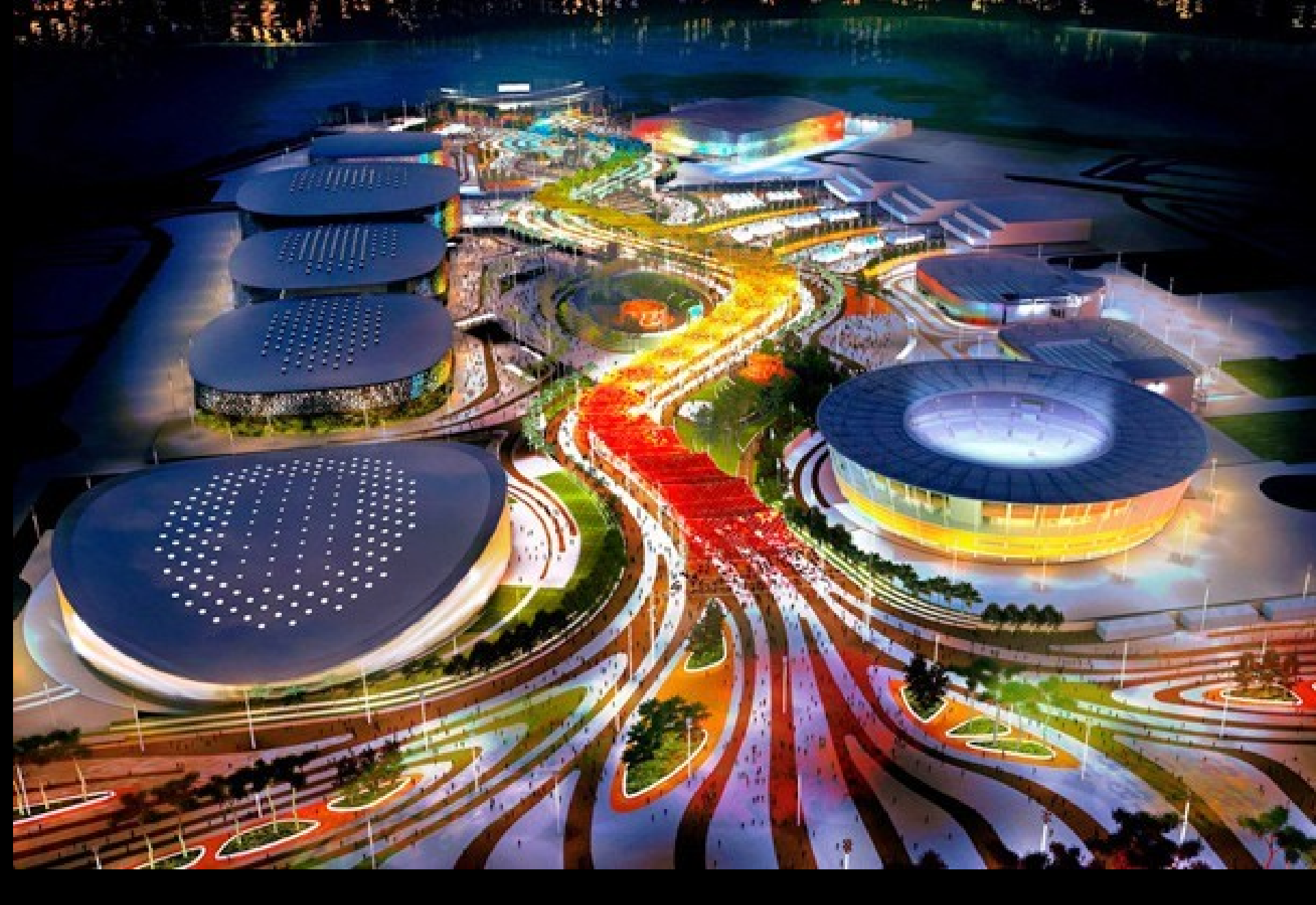
Olympic games 2016 main game site