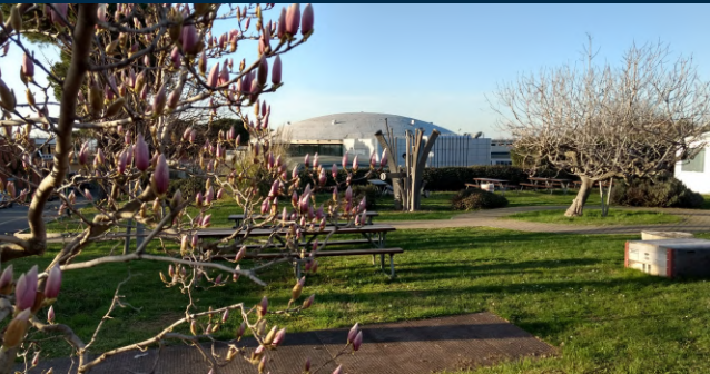
INFN, LNF Laboratori Nazionali di Frascati