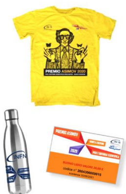
Figure 3 – Examples of gadget for students and teachers participating to the ASIMOV Prize.

In order to encourage a large participation in the ASIMOV Prize, various incentives have been devised for both students and teachers. In particular, students are encouraged to take part in the ASIMOV Prize and read at least one book to obtain school credits and/or recognition of young apprenticeship programs (for a total of 30 hours per book), which in Italy are presently called PCTO (“ Percorsi per le Competenze Trasversali e l’Orientamento ”), formerly ASL (“ Alternanza Scuola Lavoro ”), and aim to equip students with useful skills and competences for the purpose of employment. Awarded students win educational trips to one of the organizing bodies, as well as gadgets or bonuses for buying books, as shown in Fig. 3.