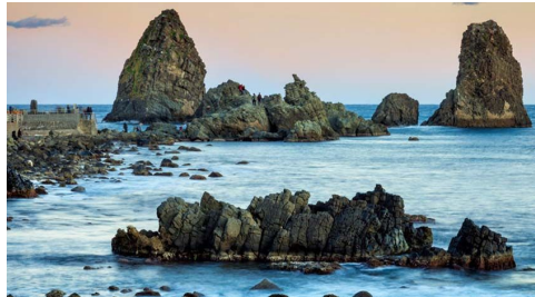
Aci Castello and Acitrezza vilages 1-2 km away

Getting there from the hotel! BUS line 534