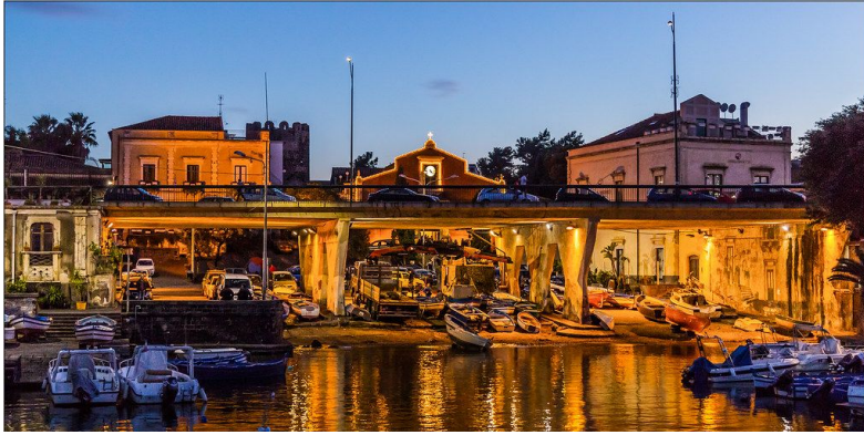
Ognina and the Catania seafront 2.5 km (south direction)