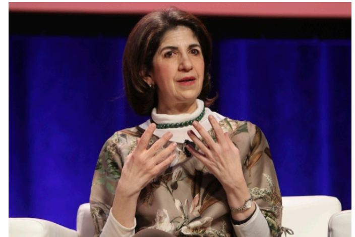
CERN director-general Fabiola Gianotti speaking at the 2019 AAAS meeting in Washington, DC.