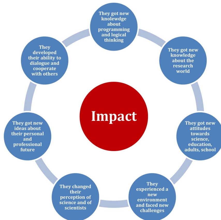
Figure 2. Impact of the coding project on participants.

The impacts on the participants are summarized in Figure 2.