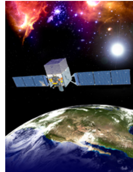
Astroparticle & Astrophysics