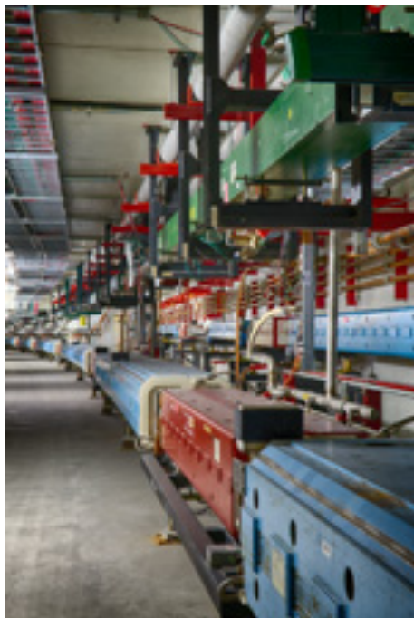
Particle physics at accelerators

Technology, Technology, Technology, Technology