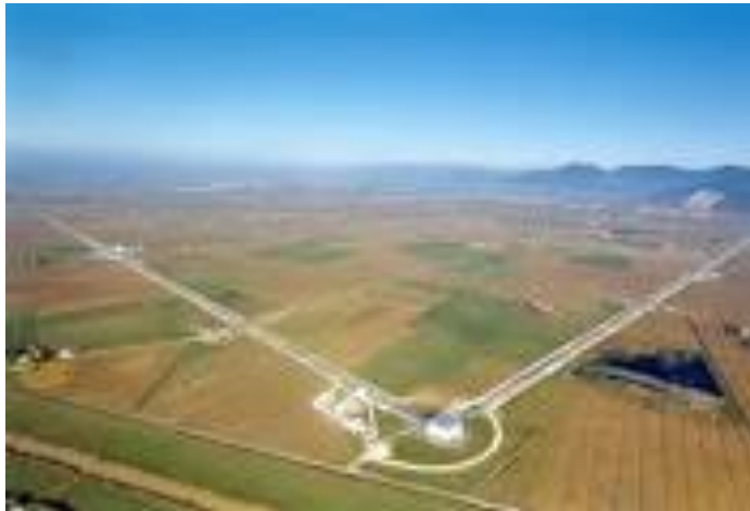
Gravitational wave physics