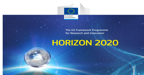
AGA – Annotated Model Grant Agreement

http://ec.europa.eu/research/participants/data/ref/h2020/mga/msca/h2020-mga-msca-if-mono_en.pdf