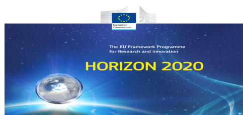
H2020 Model Grant Agreement for Marie Skłodowska-Curie Individual Fellowships (H2020 MGA MSC-IF — Mono)