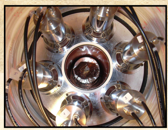
HPGe inside NaI(TI) "umbrella"

We have developed a highly selective Ge-Nal coincidence spectrometer , operating in the underground Laboratory of Monte dei Cappuccini (INAF) in Torino.